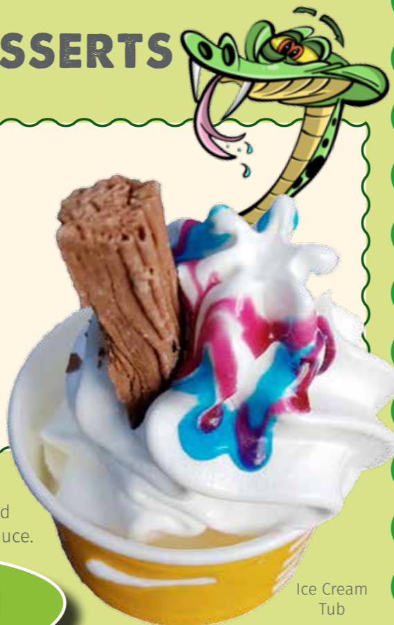
Ice Cream Tub

Goopy pieces of chocolate brownie with Belgian chocolate sauce and soft dairy ice cream.