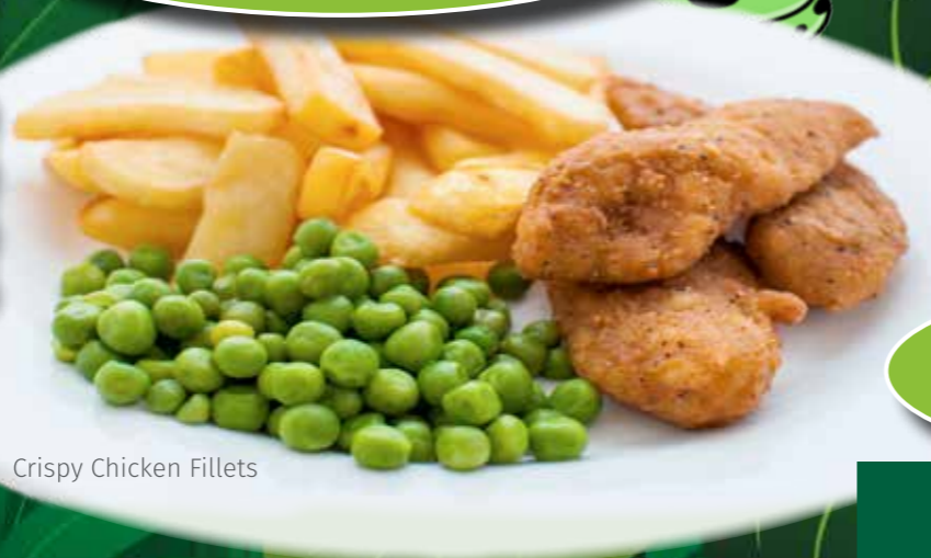
Crispy Chicken Fillets

MEAL DEAL Upgrade £1 extra with Fruitshoot